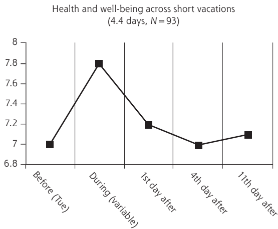
Figure 3 Health and well-being before, during and after a short vacation

Both figures show a steep increase in health and well-being during the vacation period opposed to pre-vacation levels. Baseline level of health and well-being before vacation was 7.0 in both studies. During vacation, health and well-being increased significantly to 7.7 during the winter sports vacation ( t(93) = -5.30, p = .00, \text{Cohen } d = 0.78 ), and to 7.8 during the short vacation ( t(85) = -6.33, p = .00, \text{Cohen } d = 0.90 ), indicating a medium to strong positive effect of vacation on health and well-being.